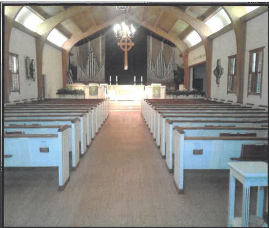
NEW FLOORING IN SANCTUARY